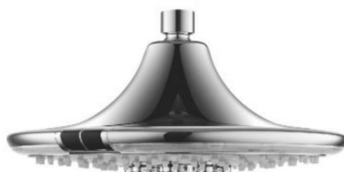
Soffione a pioggia con sensore