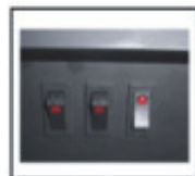
Flame off 1800W heating