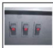
Flame on 1800W heating