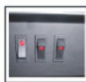
Flame on 900W heating