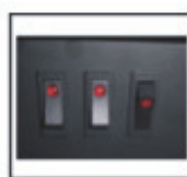
Flame on No heating